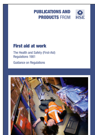
L74 (Third edition) Published 2013

This is a free-to-download, web-friendly version of L74 (Third edition, published 2013 – reissued with minor amendments in 2018 and 2024). This version has been adapted for online use from HSE’s current printed version.